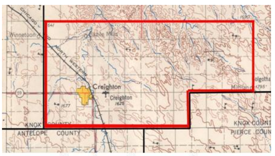
Groundwater Management Area

Seeding receipt copies required for payment. No fertilization shall be allowed.